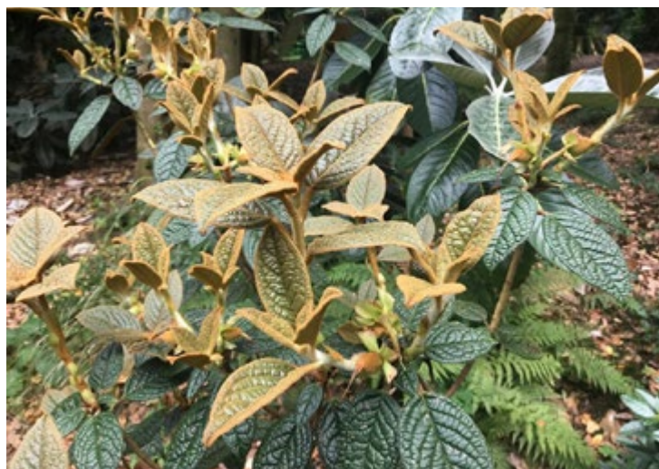
Rhododendron edgeworthii CCHH 8016 at Trewithen.