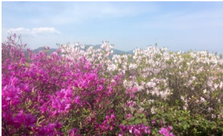
R. yedoense var. poukhanense and R. schlippenbachii growing together on M. Baraebong.