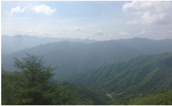
Looking into Jirisan National Park.