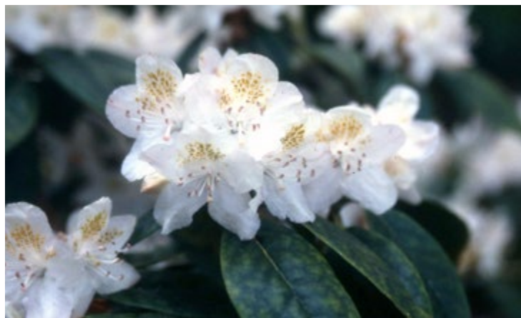
Rhododendron 'Dartmoor Snow'.