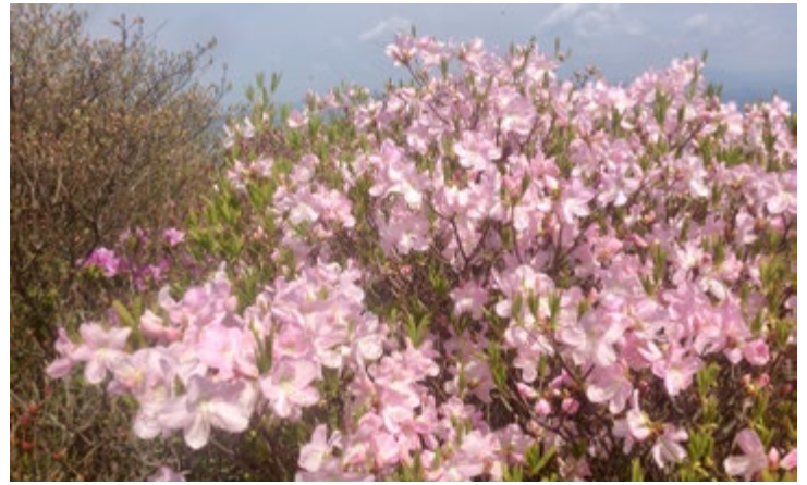
Rhododendron schlippenbachii on Baraebong Mountain