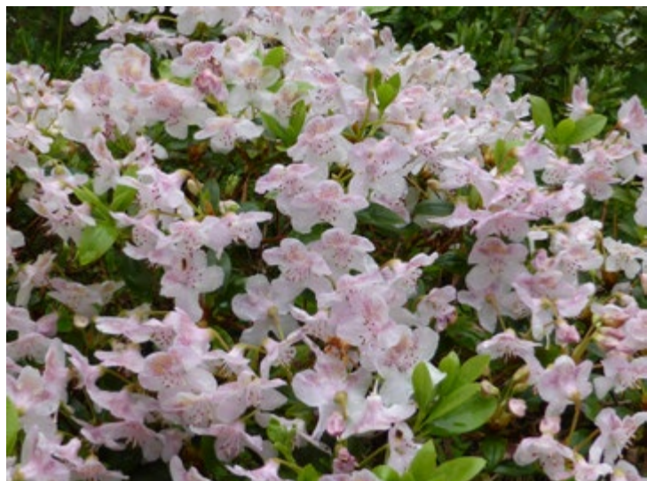
Rhododendron 'Pink Lace'

Back to the cross. R. minus is a very leafy shrub and the hybrids are abundantly foliated from late spring through summer dropping about a third of their leaves in autumn. Flowering is prodigious and is sustained through late May into early June. As one would expect most of the seedlings are white with a central yellow blotch though this latter feature varies in size through the young plants. Just one plant has pink flowers and this and the best of the whites, I felt, had sufficient merit to keep, as they certainly live up to Colin Mugridge's criteria for a good hybrid. Both parents are very hardy; neither parent is susceptible to powdery mildew; the habit is compact so that in 17 years they have reached about 70cms in height and 1m in diameter; they flowered young and produce an abundance of bloom each year and the foliage is good when it is most needed. One of them reminded me of a heavy snowstorm so this is 'Dartmoor Snow' while the other is 'Pink Lace'.