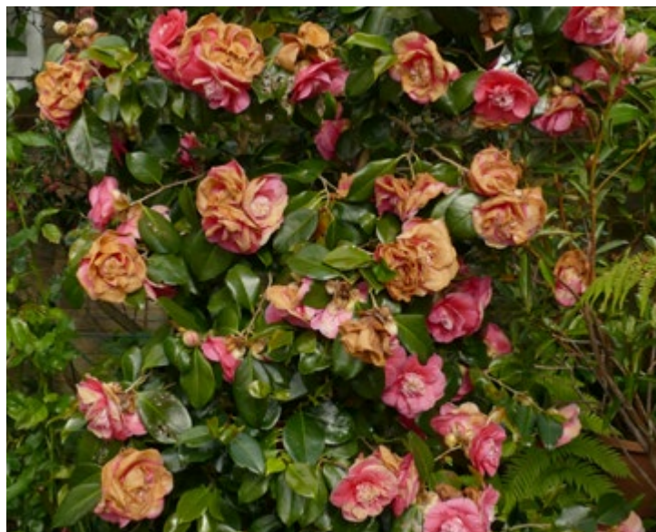
The flowers of Camellia ‘R.L.Wheeler’ turning an unsightly brown (above) and fresh and unblemished (below).

It has occurred to me since writing the above that my camellia may have been a victim of that much-feared fungal disease Camellia Petal Blight rather than being guilty of an inherent fault. If so, I can only say that no other camellia in my garden has suffered to a similar degree so it is possible that ‘R.L. Wheeler’ is unusually susceptible - perhaps because of the heavy texture of the flowers. Advice would be welcome.