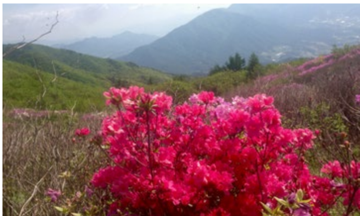
Red form of Rhododendron yedoense var. poukhanense on Baraebong Mountain.