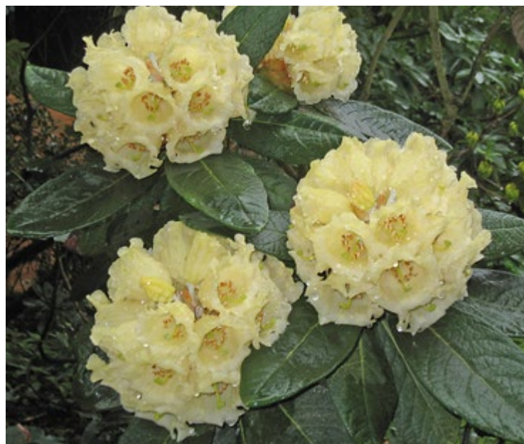
Rhododendron sinofalconeri AC1213 from Laujunshan Wenshan, Yunnan

Volunteers are needed from the membership, particularly to join the Committee, so replacing members who wish to retire.