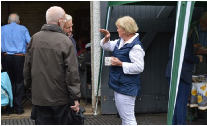
Members of the Wessex Group at Norney Grange.