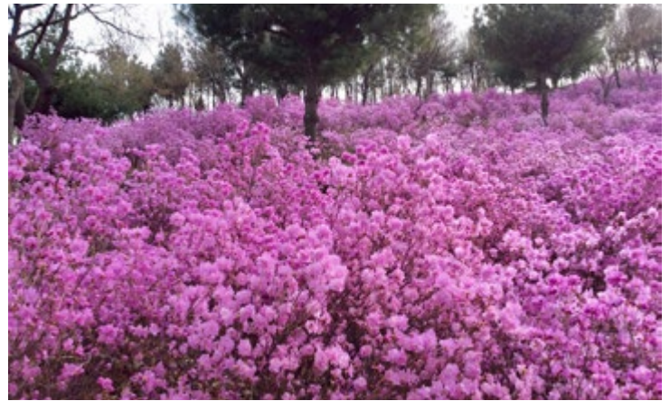
R. mucronulatum on Wonmisan Mountain near Seoul.