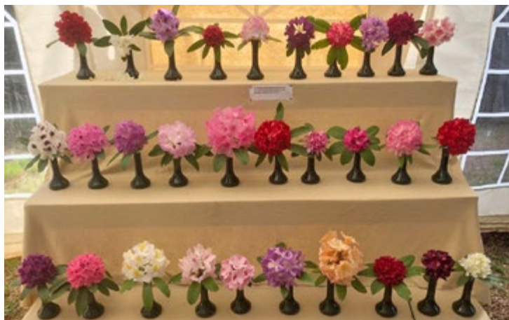
Some hardy hybrids from the RCMG collection at Ramster.